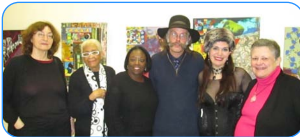
Group Photo at Reception