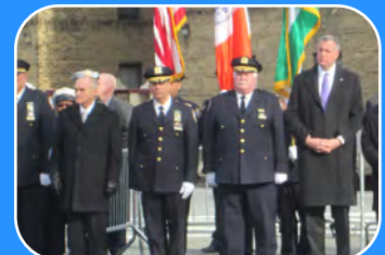
(Pictured Left to Right) Flag Draped Coffin; NYPD Commissioner Ray Kelly, who delivered a eulogy, and Mayor-elect Bill de Blasio were among those paying their respects at the funeral.