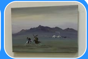
Bat Ireedui Yadamsuren