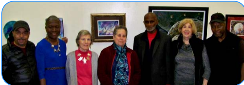
"Free Expression 2017" Artists