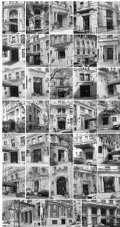
THE PORTALS OF WEST END AVENUE