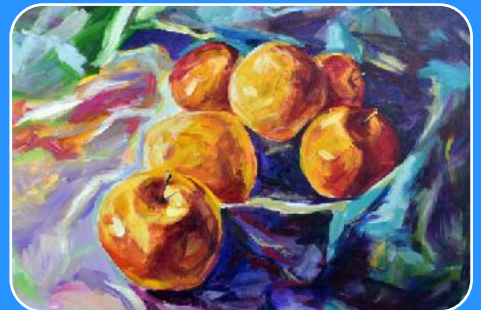
(Pictured Above, Top to Bottom, Left to Right) "Still Life with Big Wine Glass," 40" x 30" Acrylic on Canvas; "Coral Reefs as an Endangered Rainforest," 24" x 30" Acrylic on Canvas; "Reflection," 24" x 30" Acrylic on Canvas; "Still Life with Red Apples," 24" x 30" Acrylic on Canvas