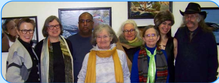
"Open 2019" Artists