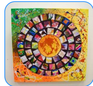
Work by Elton Tucker

The theme, which double punctuation makes broadly ambiguous, admits work even connected by very long tangents to the celebrating of the holidays or for Grinches or others who feel grief or sadness, even a brooding bitterness against a background of others' celebration. Wonderfully disparate approaches could be seen in this exhibition of twelve artists at Broadway Mall Gallery.