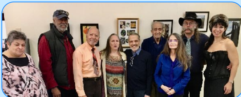
Group Photo of Artists