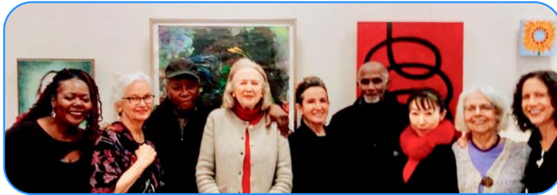
"Think Art" Artists