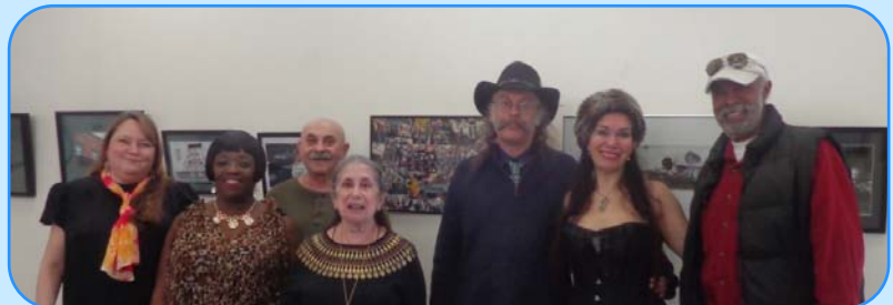
PHOTO CORRECTION: The incorrect Group Photo of the Artists was included in the November 2018 Newsletter.