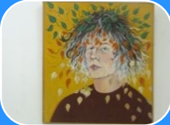
Marianne V. McNamara

Silvia Soares Boyer's "Young Harlequin With Drum" portrays just that: the harlequin with curly black hair and chequered pyjamas, the drum pink with a green top. A subject usually redolent of modernist irony, the disquieting harlequin is here portrayed in a more unconventional, defiant art brut approach.