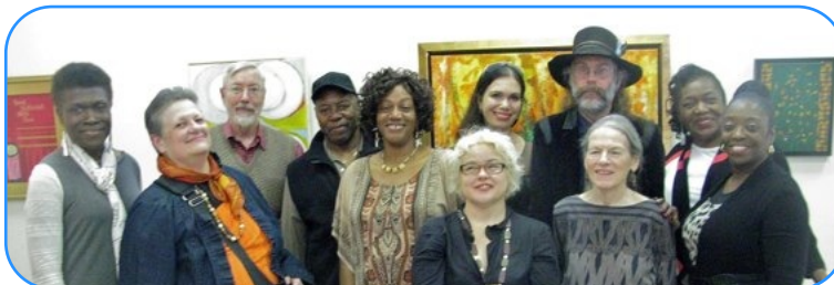
Group Photo of Artists from "Autumn Thoughts"