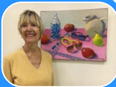
Carol Rickey