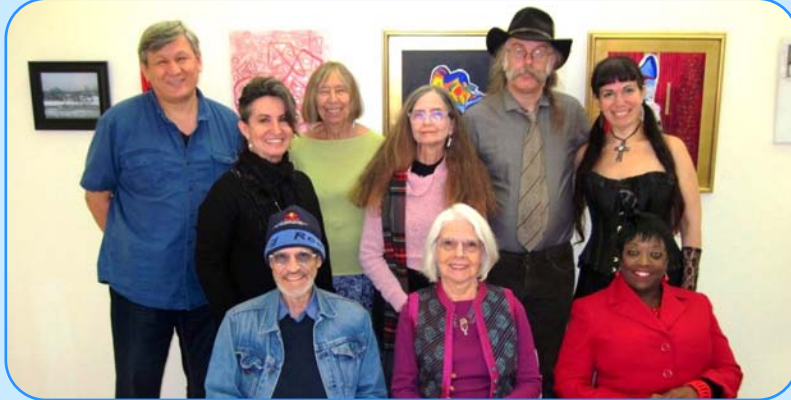
Group Photo of Artists