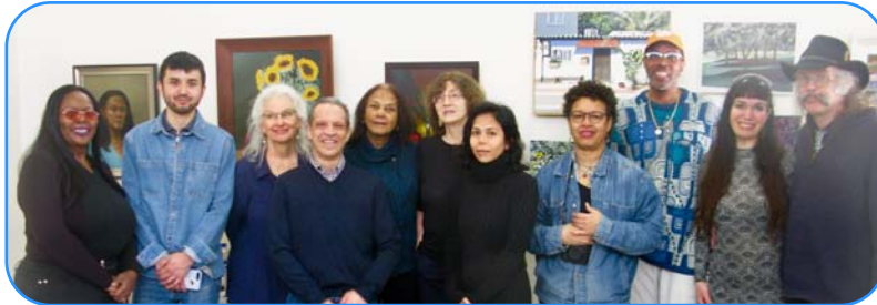
Group Photo of Artists