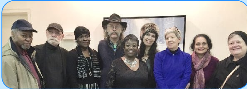
Group Photo of Artists