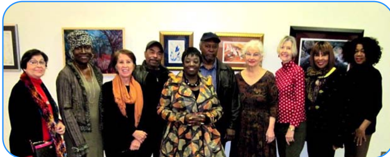
Group Photo of Artists