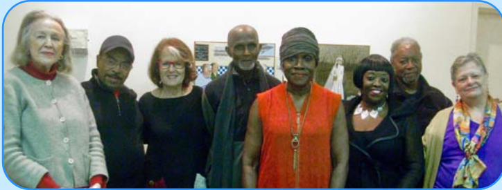
"Free Expression 2018" Artists