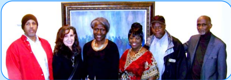
"Black Renaissance 2018" Artists